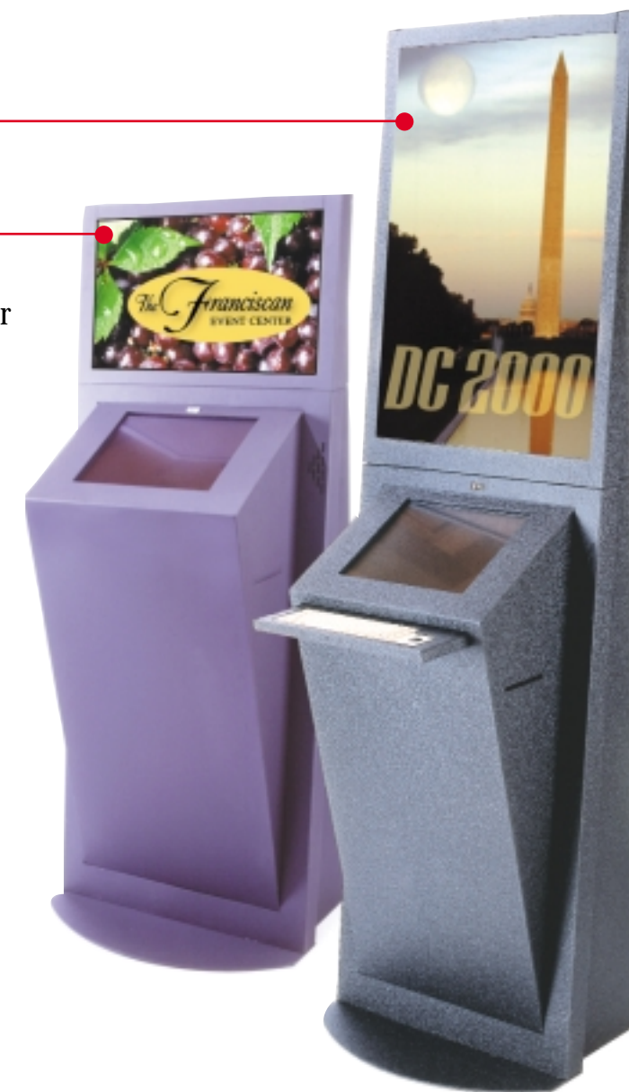
MODEL KM 818 WEDGE BOOTH