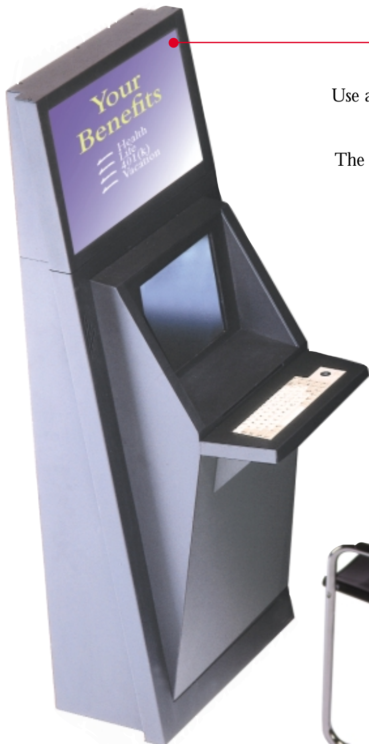
MODEL KM 816 SEATED WEDGE

Fast and easy to set up. Portable and lightweight. Wedge kiosks from KIS are ideal for trade shows, special events and surveys.